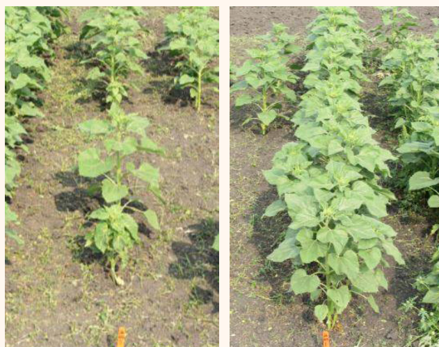
Untreated Control - 50% incidence

50% of seed planted in the untreated check had systemic infections of downy mildew. The Lumisena™ plot (on right) displayed consistent stand and healthy, vigorous plants.