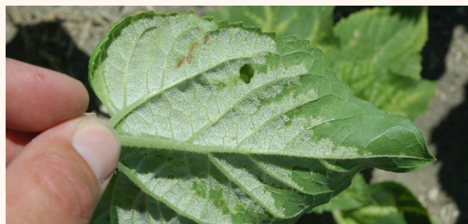
Downy mildew infected leaf with white-cottony sporulation on underside of leaf. ag.ndsc.edu

Lumisena™ is a highly effective fungicide seed treatment that is systemically taken up in the plant from the moment the seed begins to grow. Lumisena™ provides extremely effective control of downy mildew in sunflowers to protect root growth, helps provide healthy emergence and early stand establishment, and ultimately helps maximize yield.